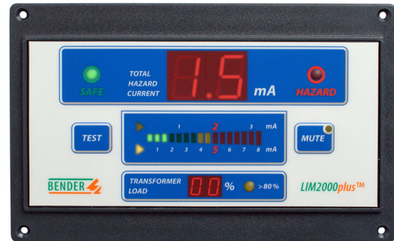
Line Isolation Monitor LIM2000plus™

The BENDER LIM2000plus™ series Line Isolation Monitor provides a digital / analog display. The LIM is available in single or three phase models with readout and response values of 2 or 5mA. The LIM2000plus™ has a patented measuring principle and is capable of detecting all combinations of capacitive and resistive faults, including balanced, unbalanced and hybrid faults. A self-test and calibration function is also featured. The LIM2000plus™ series LIM contributes less than 35µA to the Total Hazard Current (THC). Available options include load monitoring and RS485 communication. For further information see the LIM2000plus™ series data sheet.