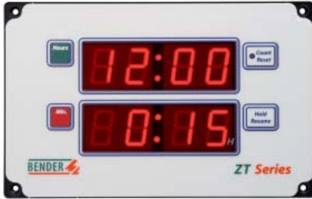
Clock / Elapsed Timer ZT1490